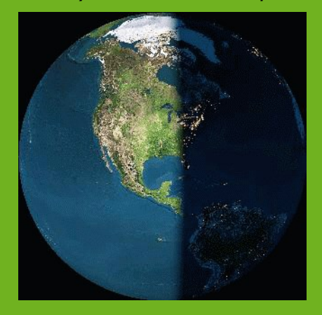
Vernal or spring equinox 2019 is on March 20 at 6:58 pm

The Bras d'Or Lake Biosphere is located in Mi'kma'ki, the ancestral and unceded territory of the Mi'kmag.