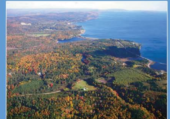
The Bras d'Or Lake as a World Biosphere Reserve

Securing the Future... of the Bras d'Or Lake